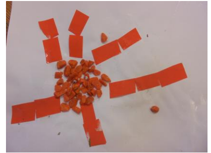
A collage of an Octopus, By Antoni, aged 3